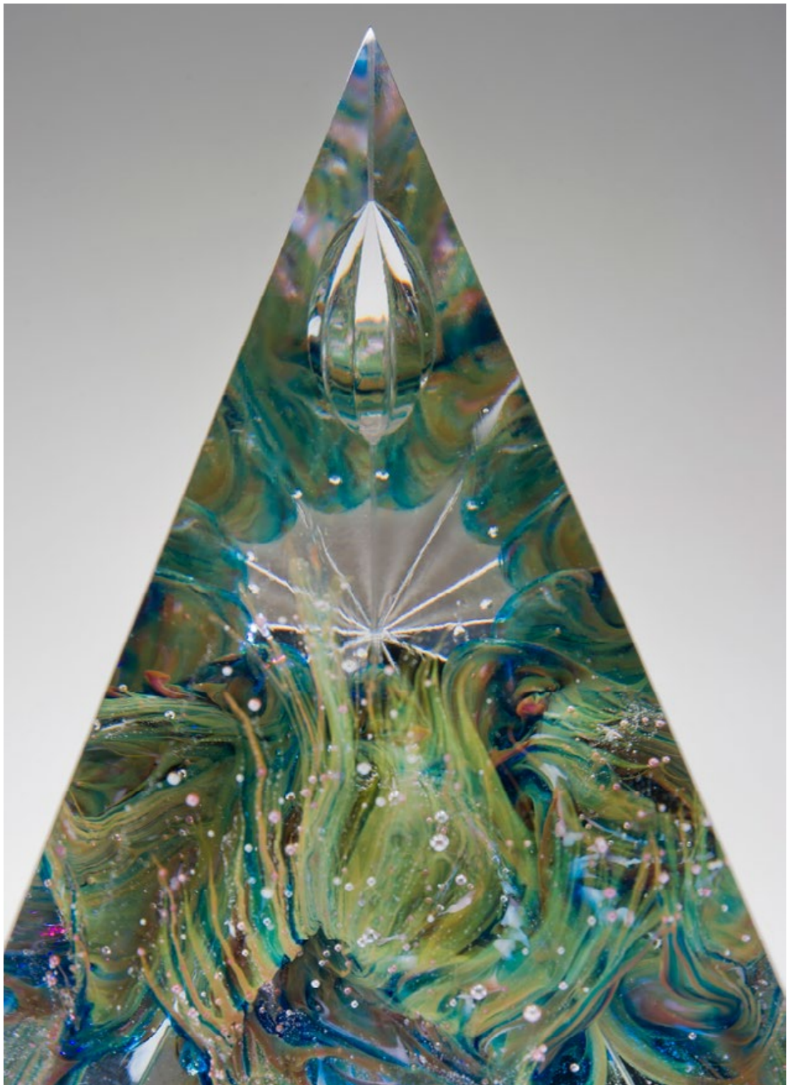
Tetra Kilncast and blown glass, cut and polished