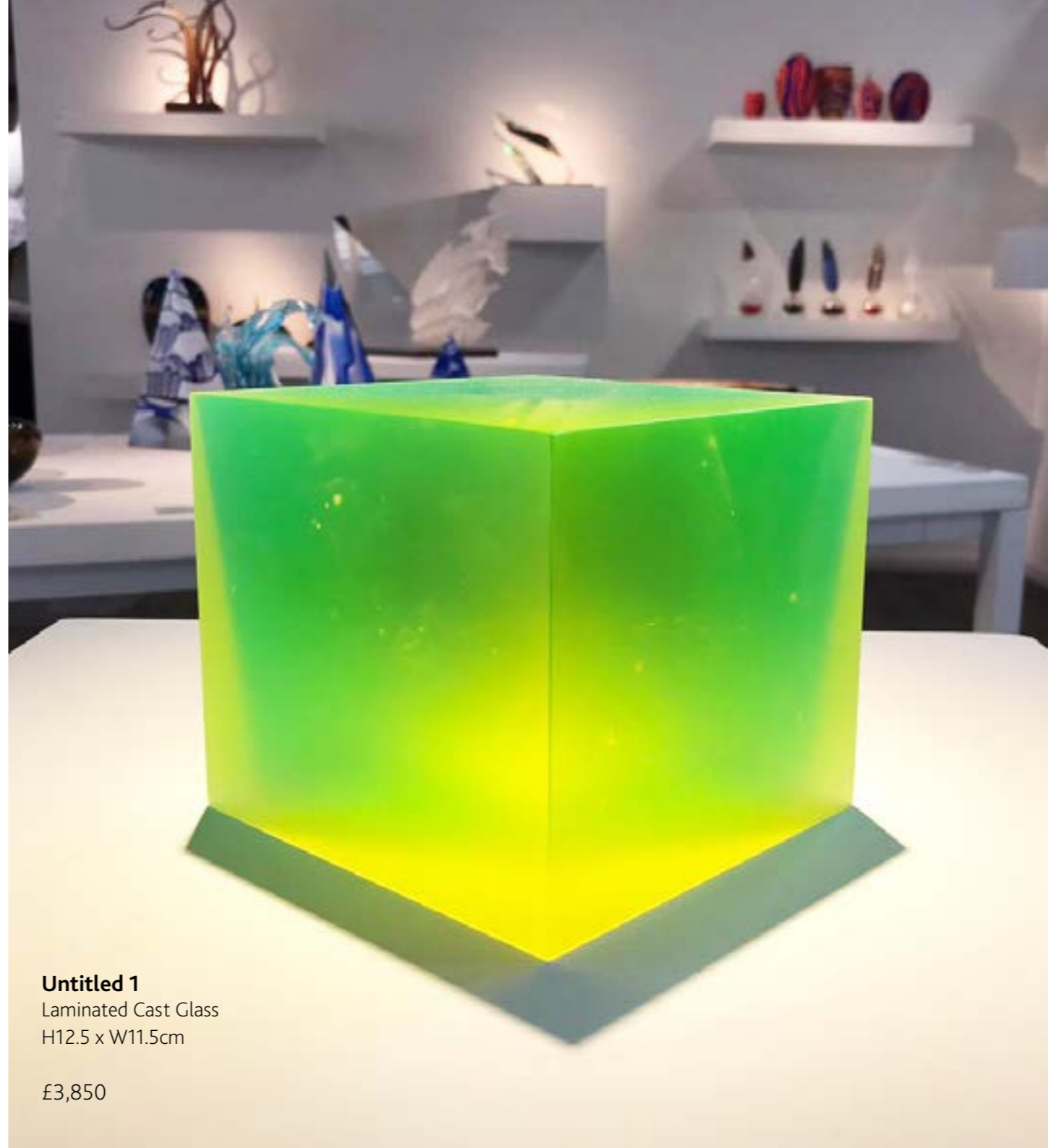
Untitled 1 Laminated Cast Glass H12.5 x W11.5cm

2020, Young Masters, London Glassblowing 18 Sep - 10 Oct