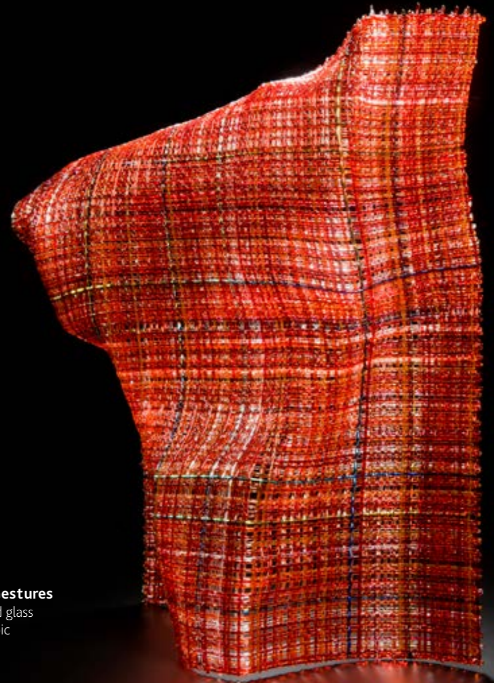
Hidden Gestures Kiln formed glass with dichroic

2015, listed as number 4 in 'The Most Game Changing Female Glass Artists